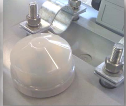
Above: Jupiter 60 XL110 with fitted photocell