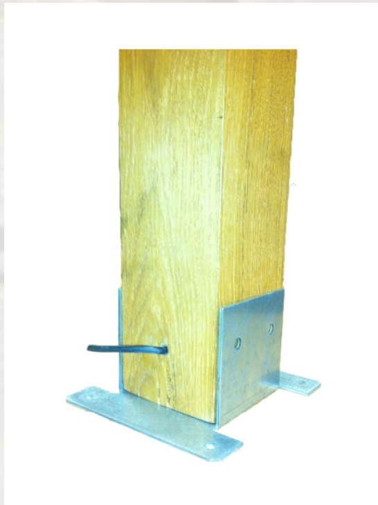
Above: Surface Mount Flange Plate – Code: FIX0027